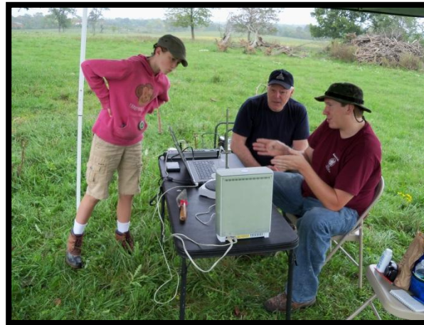
Demonstration of 3D scanning Huntsberry Farm, near Winchester, Va

Project V.C.U.-R.A.M.S., or the Virtual Curation Unit for Recording Archaeological Materials Systematically, involves three-dimensional (3D) scanning of archaeological objects (artifacts and ecofacts). We are testing and demonstrating the capabilities of this technology for its potential employment in ensuring DoD compliance with historic preservation laws.